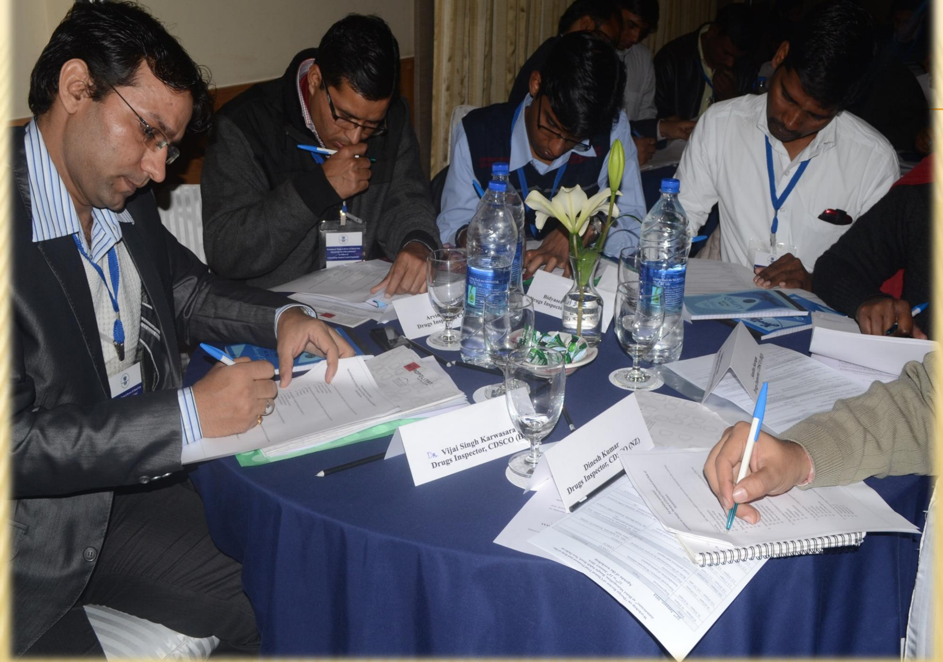
Post- assessment of the participants on 24 th January, 2014