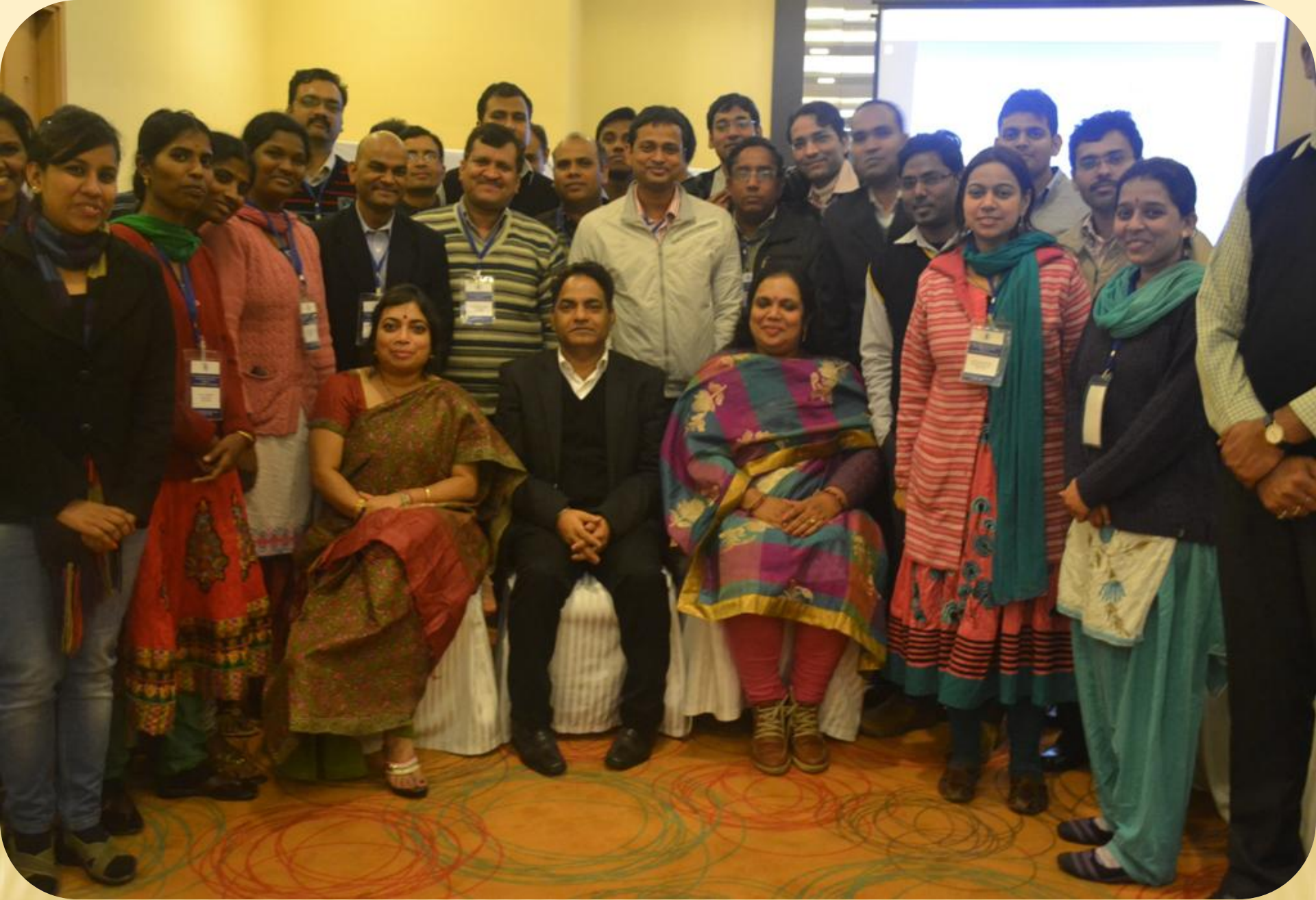
Participants for workshop