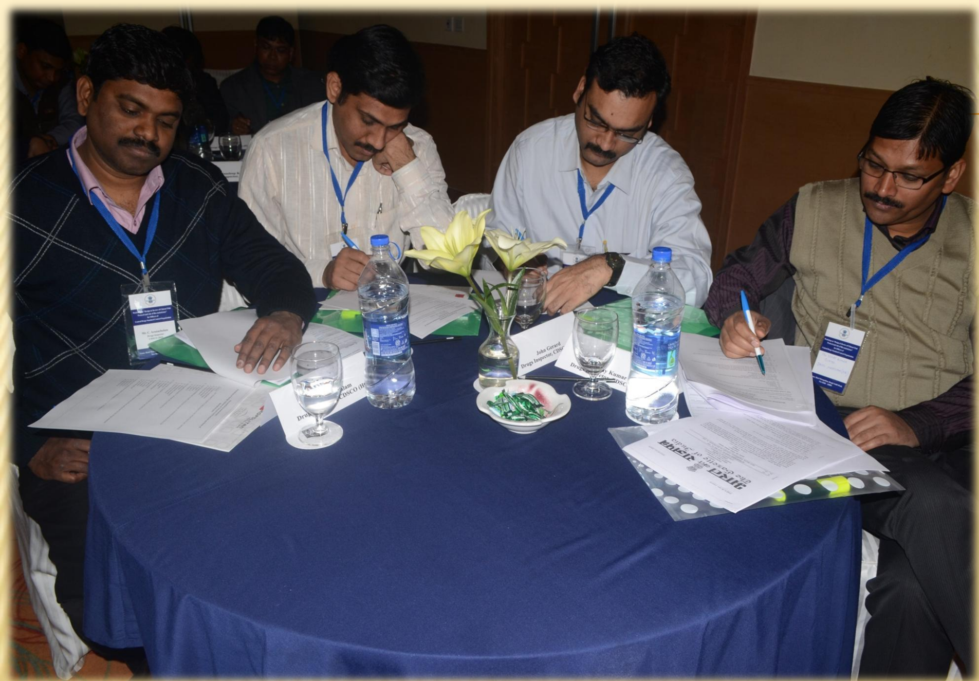
PRE - ASSESSMENT OF THE PARTICIPANTS